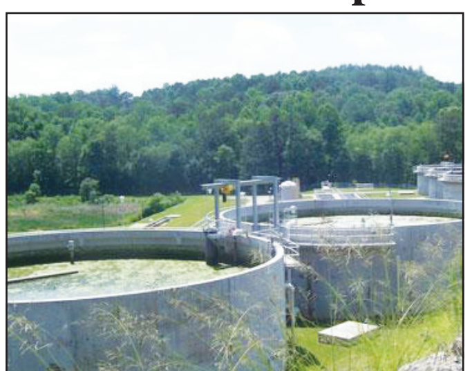
The Blairsville Wastewater Treatment Plant features a stateof-the-art computerized system that ensures the plant is always fully operational.