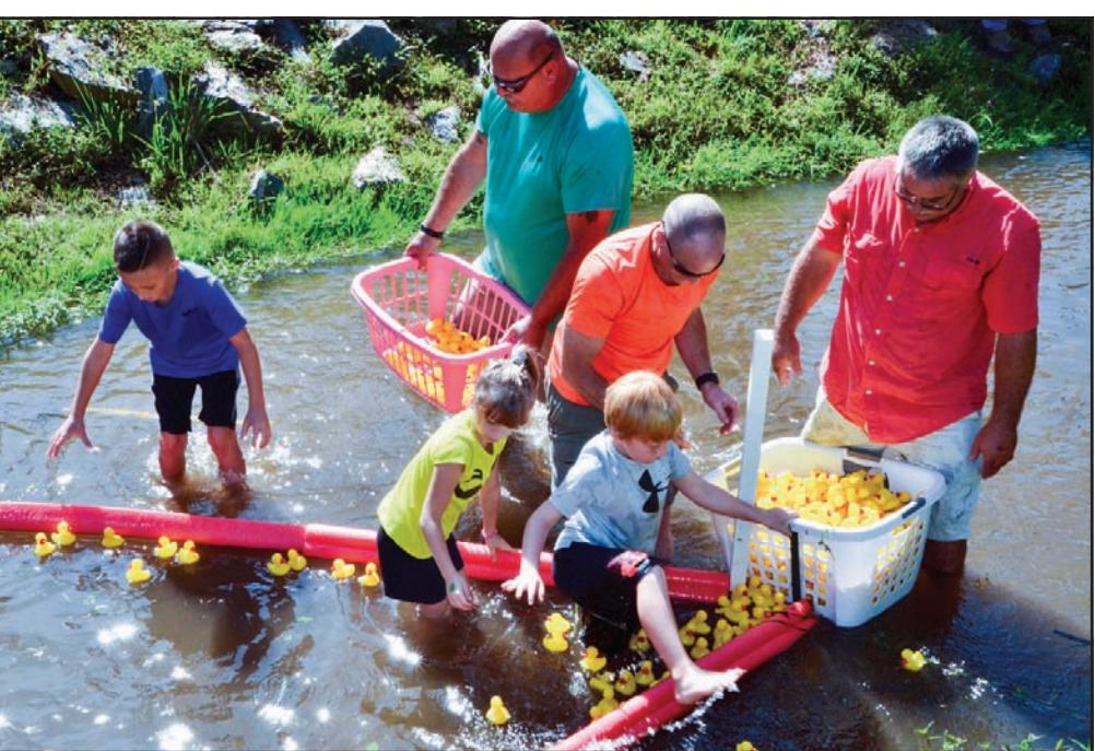
Local law enforcement and community members teamed up Saturday to hold the Second Annual Rubber Duck Derby on Butternut Creek.