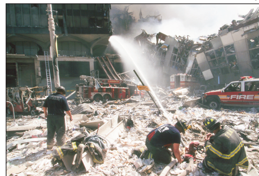
New York firefighters worked tirelessly to extinguish flames at the site of the collapsed World Trade Center towers on Sept. 11, 2001.

police officers and emergency thing he told me was, when medical professionals – who the second jet hit, they were in See 9/11, Page 2A